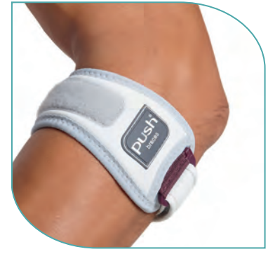
Sizing: One Size