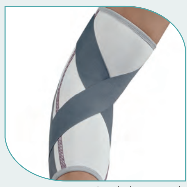
Sizing: Right or Left Elbow